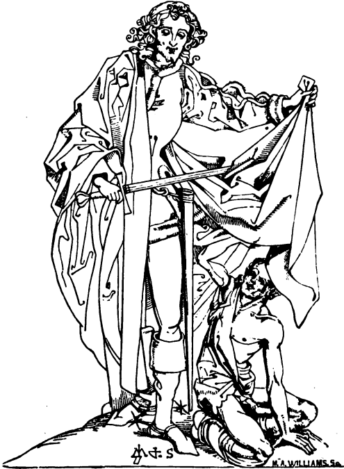
S. Martin ( Martin Schoen ).

also a great and conspicuous figure in the Church's history. This was Martin, Bishop of Tours. He was many years older than the Bishop of Milan, of whom I have just